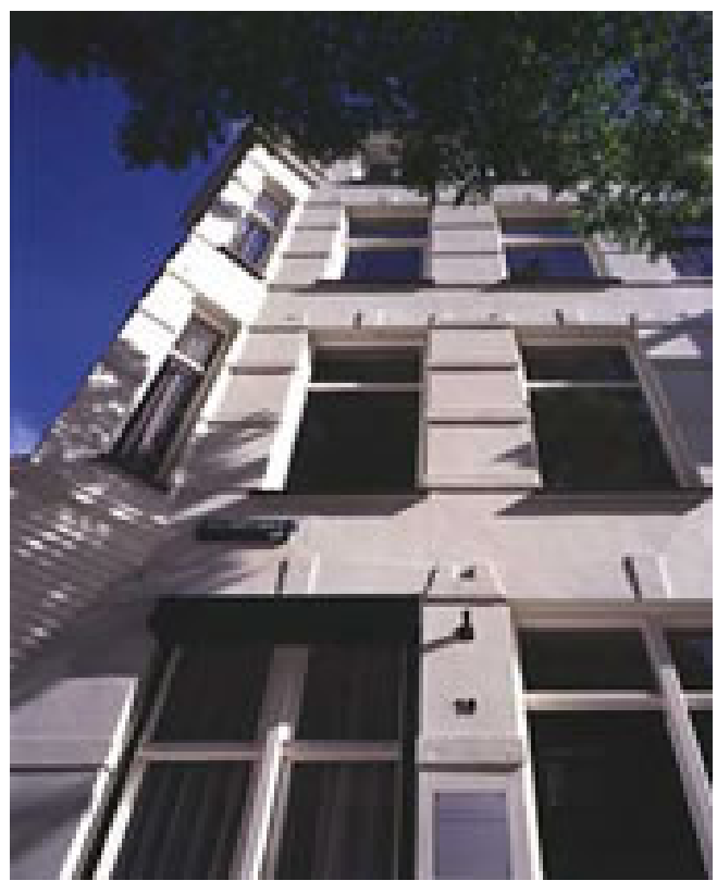
Translators' House Amsterdam

received in the authors' countries, taught me a lot. It helped me sharpen my thoughts, and often provided me with arguments I could use, for instance when presenting a title to the publisher.