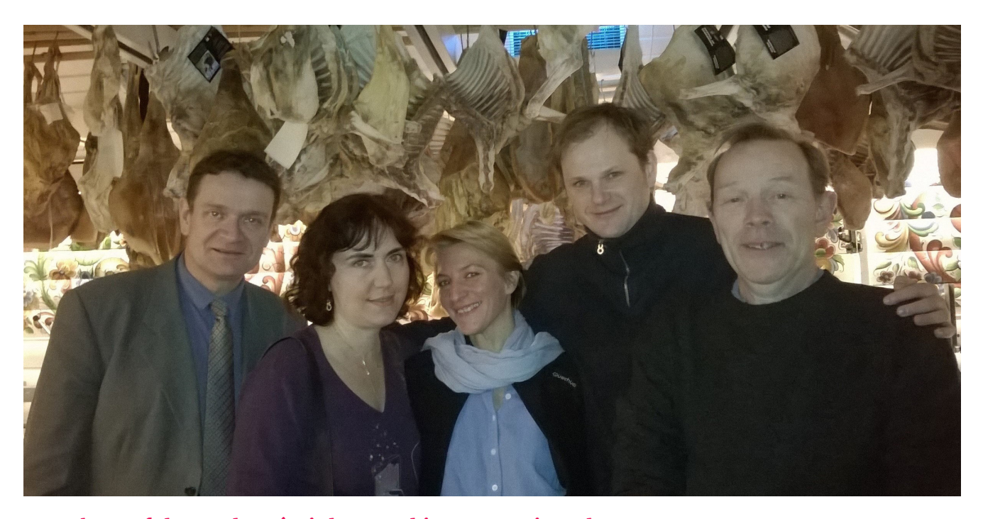
Members of the Authors' Rights Working Group in Oslo

original remuneration for a work is disproportionately low compared to the revenues it generates (Articles 14, 15 & 16). The wording of Article 12, giving publishers the right to claim a share of compensation for uses of works made under exceptions or limitation to copyright, caused quite a lot of disturbance at one point when the Estonian presidency wanted to include Public Lending Rights schemes. Together with the European federations of authors (EWC) and publishers (FEP), CEATL signed a petition asking for the deletion of this addition. At the time of writing, the directive is in the trilogue-negotiation and beyond the reach of our lobbying. (Since the final version of this article was finished, the directive has been approved by the European Parliament, eds.).