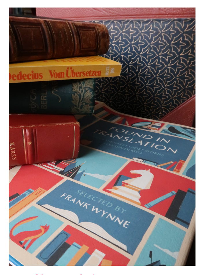
Found in Translation

the best short story ever written in the language since, like so many cultures, Uzbek is little represented in English translation, but I felt it was important for the anthology to include voices new to me, and hopefully to readers. What began as a sprawling list of almost 300 stories, I gradually whittled down to about 160, and, from here – as we acquired permissions – the list was refined to 100. There were stories that I wanted to include but could not – either because permission was refused, or because the rights holder - often a literary agent – simply asked for more money that had been budgeted. In one case, a translator wanted to revise his published translation but could not do so in time for it to be included.